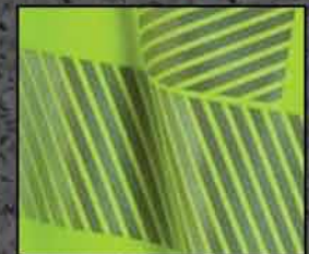
SEGMENTED COMFORT TRIM

ANSI/ISEA 107-2010 Class 3 compliant 100% polyester, moisture wicking, lime/yellow with red/orange neck, sleeves, and pocket. Heat transfer trim can be 3M™ Scotchlite™ Reflective Material as 8725 solid 2" certified for 50 home washings or 5510 segmented comfort trim 2" certified for 75 home washings. Heat transfer trim is also available from Orafol which is GPO25 solid 2" certified for 50 home washings. The trim pattern is one 2" wide horizontal band 360 degrees around waist and on both sleeves with a 2" wide band harness over each shoulder. It may be necessary to add an additional 2" wide horizontal band on front or back in order to meet the ANSI standard for square inches on some sizes. The pocket size is 4.5" wide x 5" high on the left chest. When ordering the 3M™ Scotchlite™ Reflective Material - 5510 Segmented Home Wash Trim 2" add "CT" to end of the style number, size: S - 6XL.