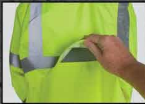
VENTED BREATHABLE MESH