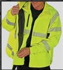
ZIPS INTO PARKA