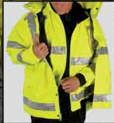
ZIPS INTO PARKA