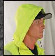
HOOD (AVAILABLE) #AV-AWS-315HD