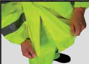
HOLSTER OR UTILITY BELT ACCESS