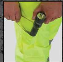
SIDE BELLOW POCKETS