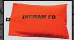
LETTERED VEST BAG