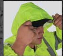
TUCK AWAY HOOD