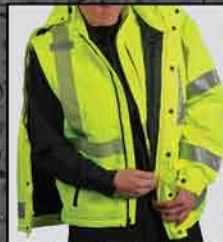
ZIPS INTO PARKA